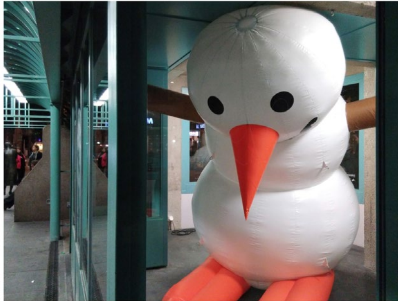
Jan Kiefer: 'Skiing Snowman', 2016 © Jan Kiefer, Union Pacific London

Condo is spread across the city, so there'll be a fair whack of travel involved if you want to hit every gallery (and you should, even if it involves venturing to darkest Mile End and the like). The preview takes place this weekend, so it's best to split your visit across both days.