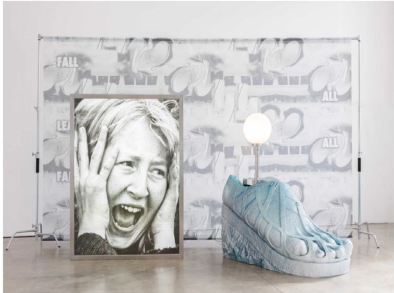
Guan Xiao: 'Flattened Metal', 2016. ICA London.

In a nutshell: 21 incredible contemporary art galleries from as far afield as New York, Berlin and São Paulo are taking up month-long residence at 15 of London's best young galleries. The guest gets a place to exhibit in London. The host gets to show their own artists' work alongside them. It's a massive art party, it's a festival, an art fair: it's essentially Match.com for the international gallery scene, and we get to watch all the canoodling (in a non-creepy way. Obviously). And after a highly successful debut in 2016, it's now doubled in size, so there's even more to see.