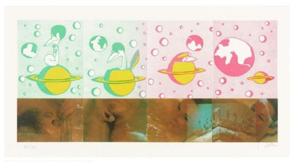
"Hallo Shiva" by Sigmar Polke, 1974

Until August 22, 27 Margaret Street, London, ibidprojects.com