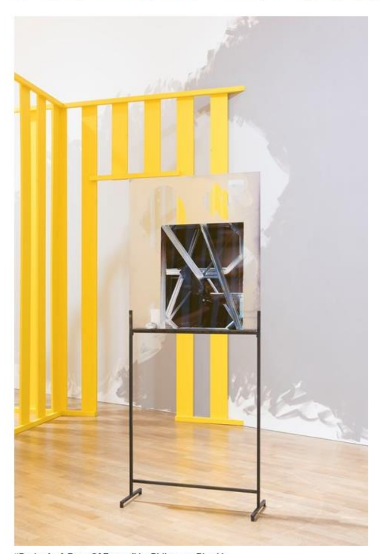
"Desire As A Form Of Energy" by Philomene Pirecki

Until August 8, Pace London, 6 Burlington Gardens, London, pacegallery.com