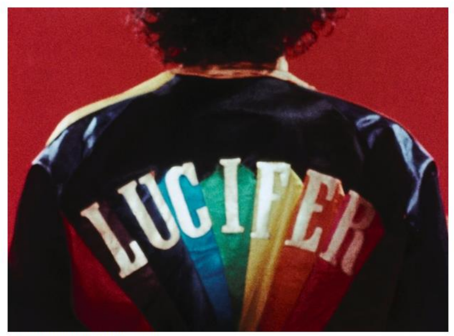
Still from Kenneth Anger's Lucifer Rising

Various dates, July 17-27, 10 Sloane Rd, London, fiorucciartrust.com