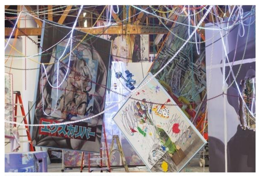
"A Lil Taste Of Cheeto In The Night" by Parker Ito

Until Aug 14, 525 West 24th Street, NYC, andrearosengallery.com