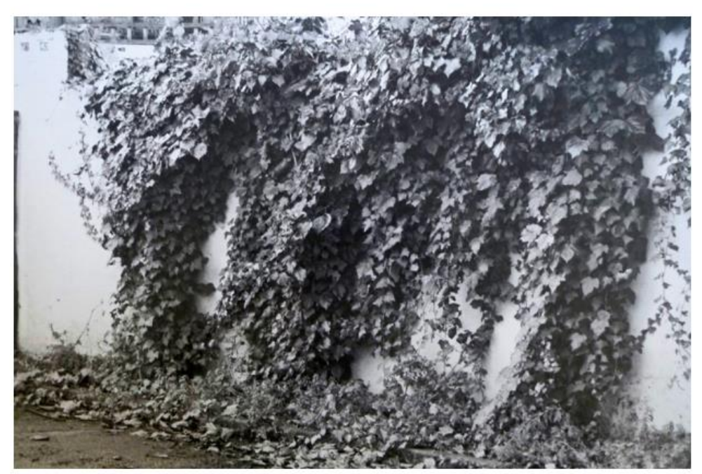
"(Untitled) Discuss your dreams or pull the ivy off" by Terence McCormack

July 10-7pm - Aug 10, 10 Cazenove Road, London, projectnumber.org